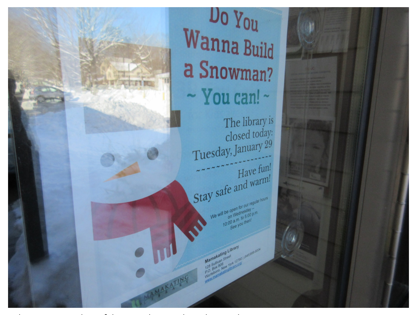
Flyer as seen on door of the Mamakating Library last week.

Share a library-related photo, include a brief caption, your name, position and the library's name. A photo release is required from recognizable individuals in the photo. <u>Click here</u> for the RCLS photo release. Submit the picture to <u>rclsmemo@rcls.org</u> with 'Photo of the Week' in the subject line.