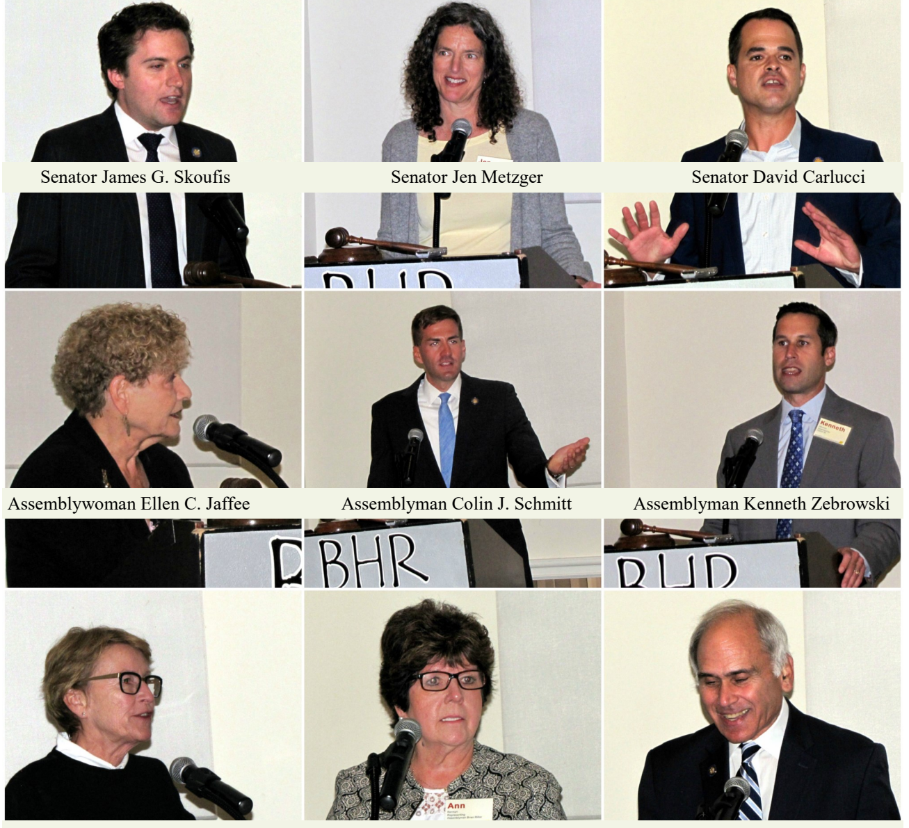
Assemblywoman Aileen M. Gunther

If you were unable to attend the Legislative Breakfast and Annual Meeting and would like to view the program, it can be found on the RCLS website.